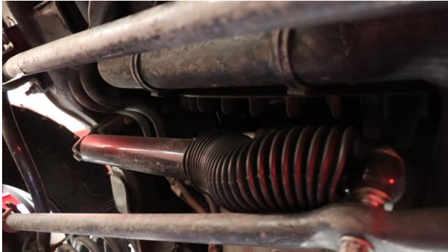
Stock steering damper