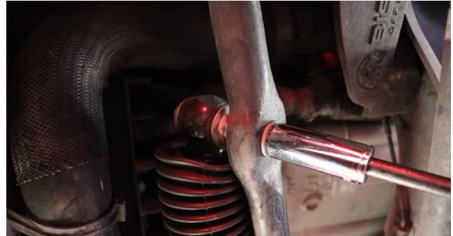
1. Remove 15mm bolt on right side of damper at frame