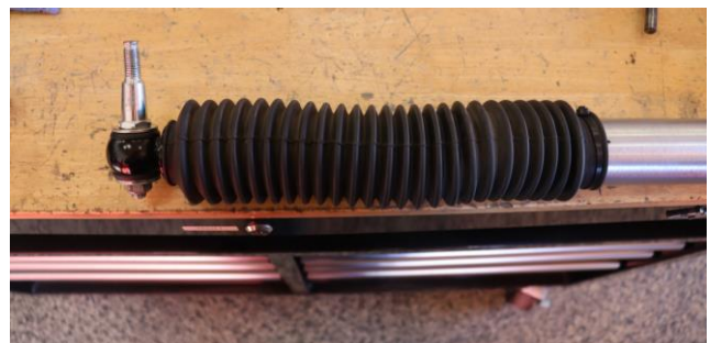
5. Install boot onto damper with included zip tie