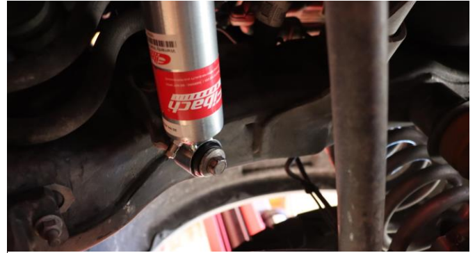
7. Use 15mm bolt to install body end of damper onto frame