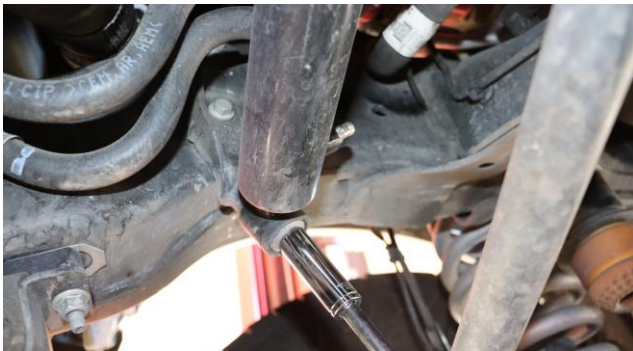
2. Remove 18mm bolt on left side of damper at drag link