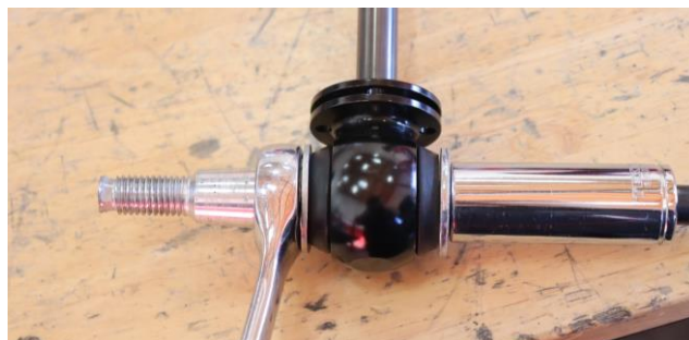
4. Install stud in rod end of steering damper using 22mm wrench and 17mm socket