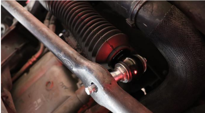
6. Install rod end of damper with stud into drag link